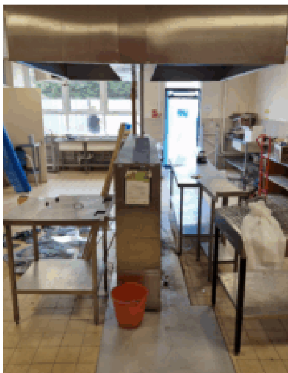
Kitchen refurb at the school