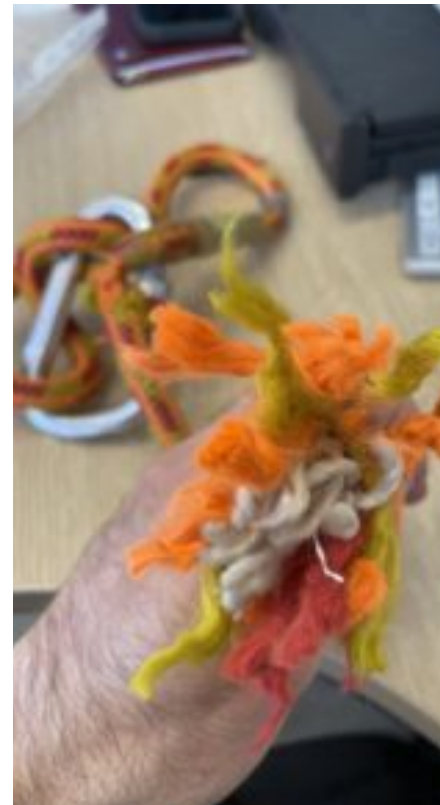
The rope being used to tie to branches snapped during the tree felling work